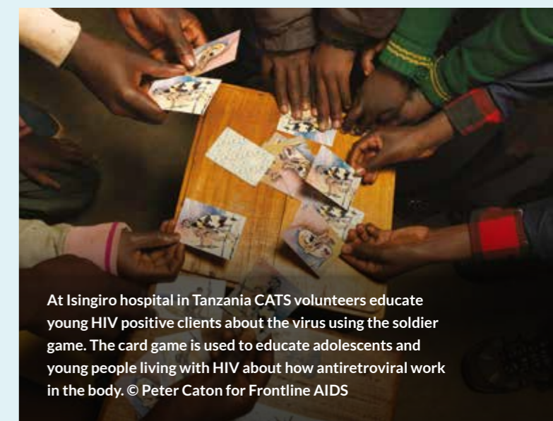
At Isingiro hospital in Tanzania CATS volunteers educate young HIV positive clients about the virus using the soldier game. The card game is used to educate adolescents and young people living with HIV about how antiretroviral work in the body.