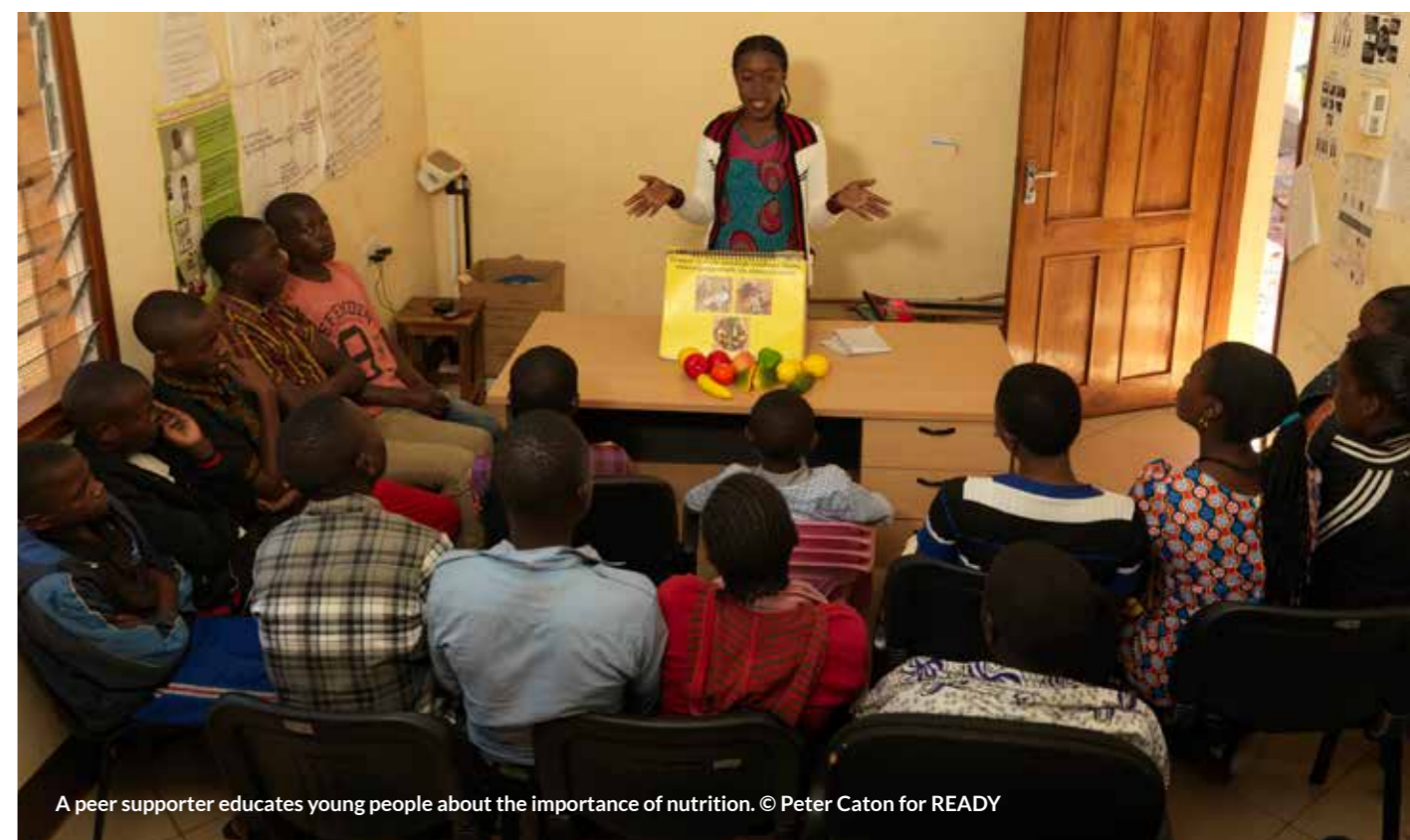
A peer supporter educates young people about the importance of nutrition.