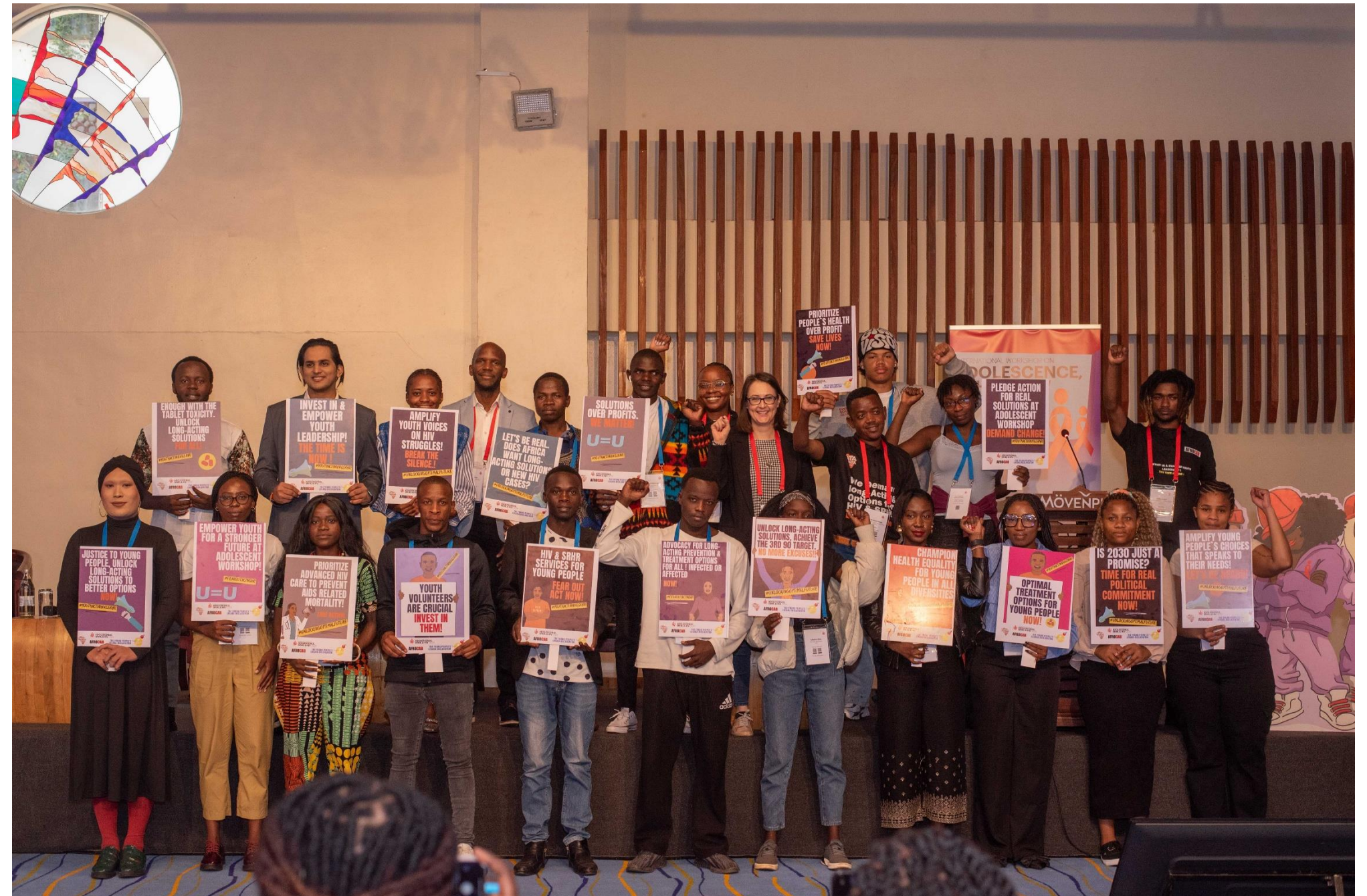
International Adolescent Workshop on SRHR&HIV Demo.