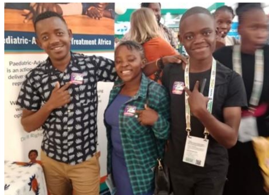
Signing of the Declaration